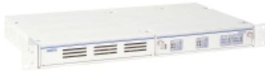
2xE1 Baseband Processor